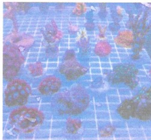
Rich - Eco Reefer

International Betta Congress Species Maintenance program on wild Bettas