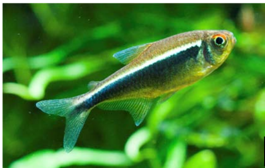
Black neon tetra, Hyphessobrycon herbertaxelrodi

Whether we remember him as philanthropist or not, his mark on fishkeeping is indelible and one that deserves the widest recognition. Perhaps — just perhaps — he was the singlemost influential fishkeeper the hobby and industry has seen.