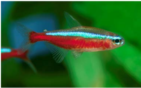
Cardinal tetra, Paracheirodon axelrodi

The mid-1950's marked the beginning of another of Axelrod's fishkeeping legacies — the number of fish named after him. Regardless what genera of fish you keep personally, chances are that Axelrod's hand is somewhere in your collection.