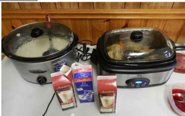
Clam Chowder, Turkey dinner in one