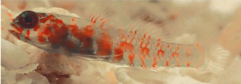
Eviota eyrae . California Academy of Sciences

Researchers with the California Academy of Sciences and Hawaii's Bishop Museum have described five new goby species of the genus Eviota that have recently been discovered in Fijian waters.