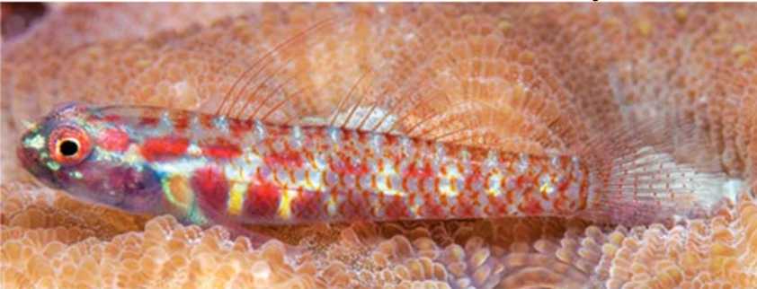
Eviota teresae . California Academy of Sciences

The fish collections are with the California Academy of Sciences in San Francisco, Calif.