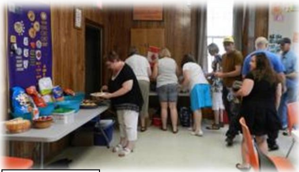
Lots of food

The June meeting was traditionally the President's barbecue. Due to some constraints, it became a Pot Luck. We had good attendance at this meeting. You missed some good food and comradery. Here are some pictures: