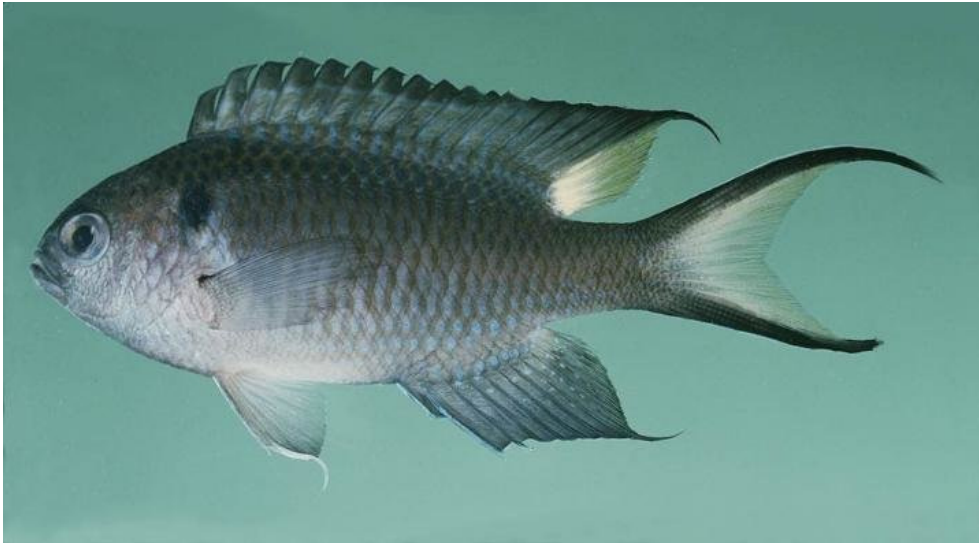
Regal Damselfish is shown.

Nova Southeastern University. "Potential invasive species identified in S. Gulf of Mexico: Research shows non-native damselfish in part of Gulf." ScienceDaily. ScienceDaily, 19 January 2016. < www.sciencedaily.com/releases/2016/01/160119141800.htm >..