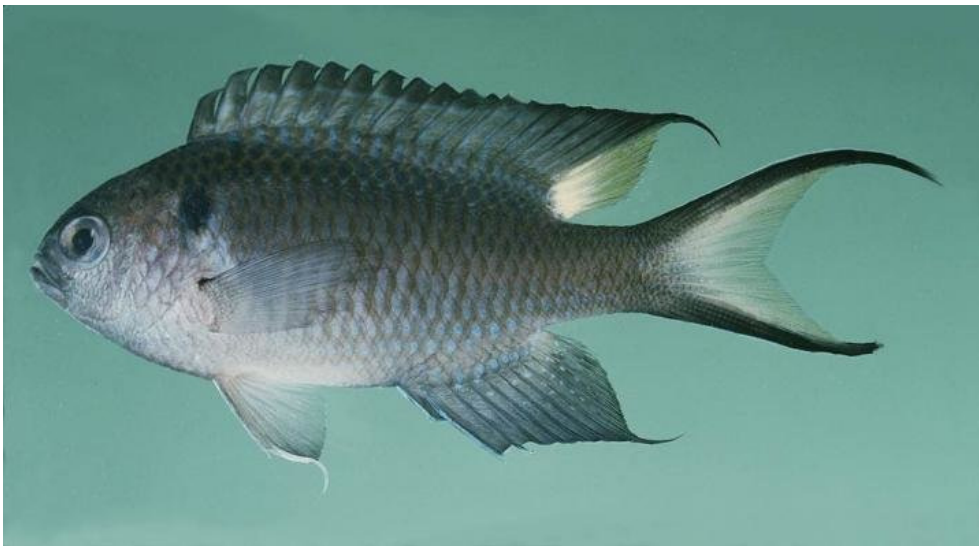
Regal Damsel fish is shown.

Nova Southeastern University. "Potential invasive species identified in S. Gulf of Mexico: Research shows non-native damselfish in part of Gulf." ScienceDaily. ScienceDaily, 19 January 2016. < www.sciencedaily.com/releases/2016/01/160119141800.htm >..