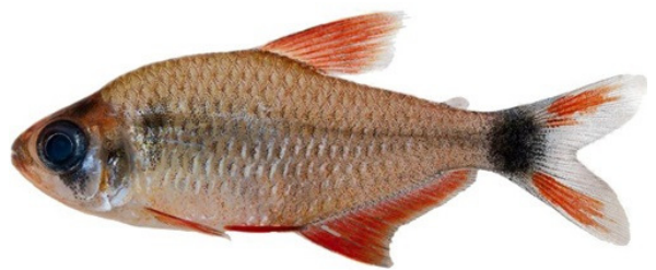
Hyphessobrycon delimai .