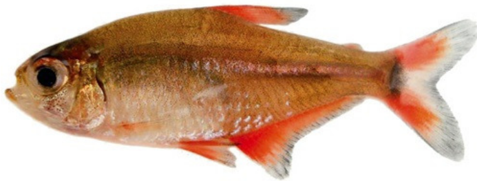
Hyphessobrycon krenakore .

http://www.fishchannel.com/fish-news/2015/12/two-new-tetra-species-discovered-and-described-trending.aspx