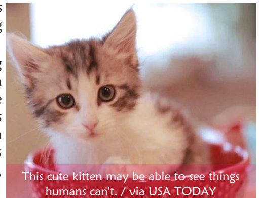
This cute kitten may be able to see things humans can't.