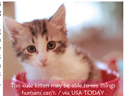
This cute kitten may be able to see things humans can't.