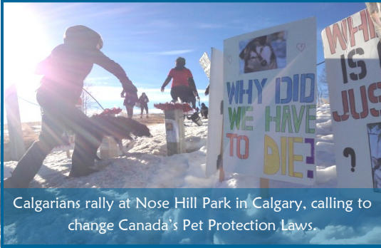
Calgarians rally at Nose Hill Park in Calgary, calling to change Canada's Pet Protection Laws.

http://www.660news.com/2014/01/25/calgarians-rally-to-change-canadas-pet-protection-laws/