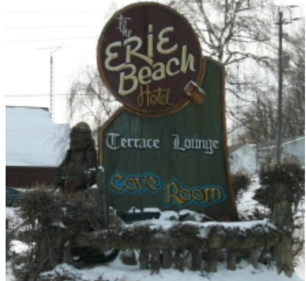
We are pretty sure that there won't be any snow on the ground at Convention